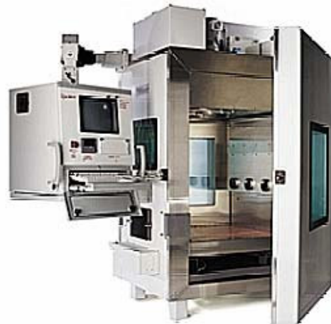
Highly Accelerated Life Test (HALT) equipment